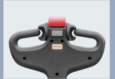
The upright-tiller running function allows it to work within confined space, such as container